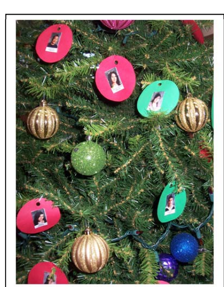
THE SENIOR SPIRIT TREE AT BRUCE RANDOLPH HIGH SCHOOL. EVERY SENIOR HAD AN ORNAMENT WITH THEIR PICTURE ON THE TREE. DECEMBER, 2010.

"The skills I have acquired and the experience in the classroom is far more valuable than my paycheck and I am very grateful to have this position and to be working with such phenomenal people within DU and South" -Coach at South High.