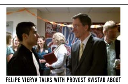
PUBLIC ACHIEVEMENT AND PUKSTA PROGRAMS.

In March 2011, CCESL hosted an open house that brought together faculty, staff, students, and community partners to learn about CCESL initiatives as well as dialogue about the future of CCESL's work.