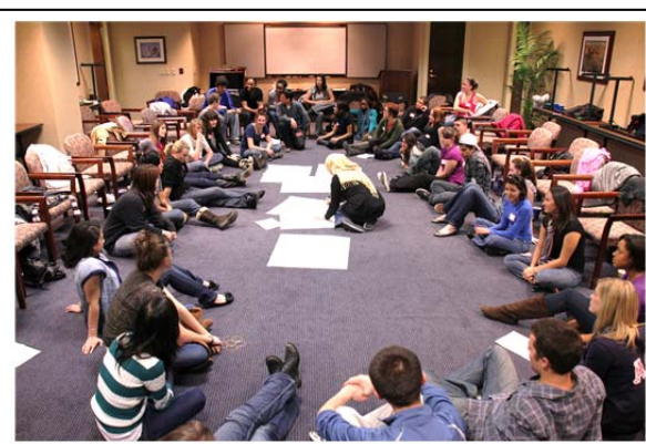
FORTY PUKSTA SCHOLARS FROM DU, CU-BOULDER, AND CSU REFLECT AFTER A DEMOCRATIC AND POPULAR EDUCATION TRAINING IN THE MORGAN STANLEY BOARD ROOM

"I have had to learn how to encourage organization in others as well as take on organizational aspects of projects for myself."